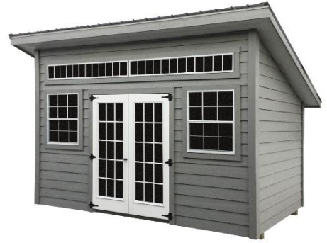
Shown with optional transom windows & 15 Lite in doors